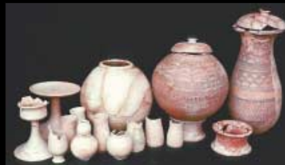
Pottery from a grave at Harappa.