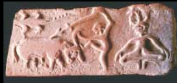
Small terracotta tablet from Harappa depicting part of a mythological scene. Combat between human and animal or animal and animal is often depicted.