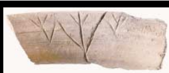
Potsherd with incised triple-trident sign found in early levels at Harappa and dating sometime between 3500 and 2800 BCE.

In order to prove that the Indus civilisation was Aryan, the language has to be deciphered as a form of Sanskrit and there has to be evidence of an Aryan presence, which currently is being associated with