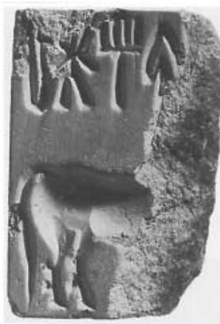
M-772A (flipped horizontally)