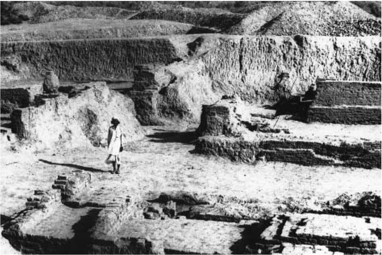
Harappa, area of the 'parallel walls.'

gates." All Indian history, Rajaram writes, can be pictured as a struggle between nationalistic and imperialistic forces.